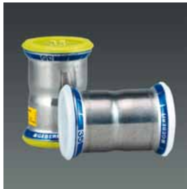
Mapress fittings with protection plugs