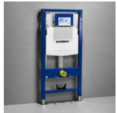
Geberit Duofix frames for wall-hung sanitaryware