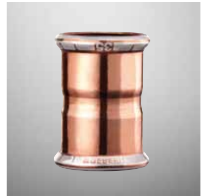
Mapress Copper pressfitting