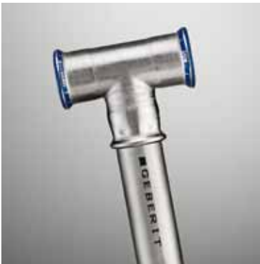
Mapress Stainless Steel pressfitting