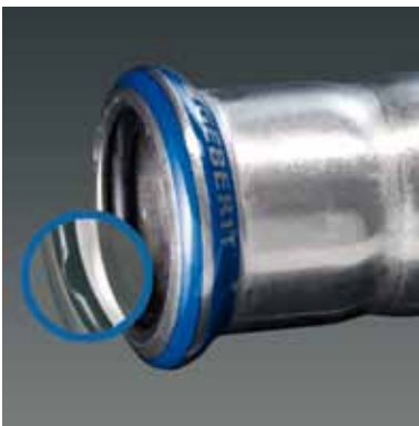
Seal ring contour