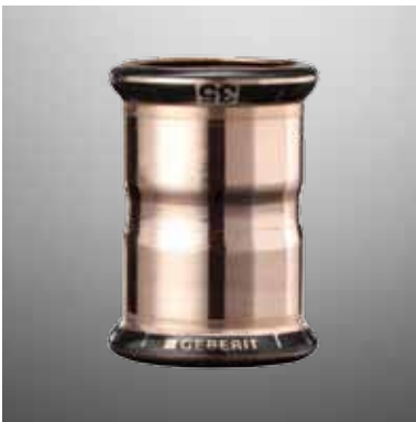
Mapress CuNiFe pressfitting