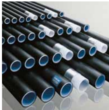
Mepla system pipe