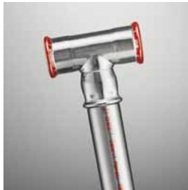
Mapress Carbon Steel pressfitting