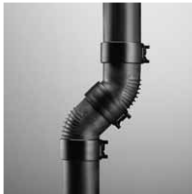
Geberit drainage systems