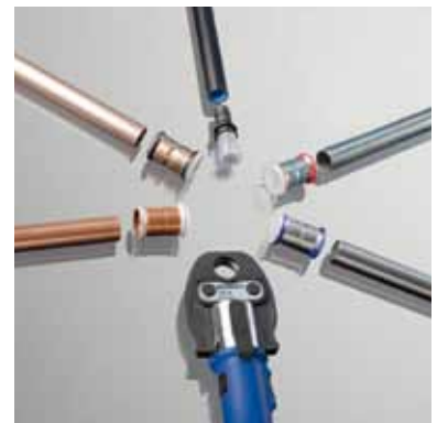
Geberit supply systems with pressing tool