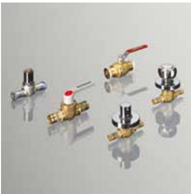
Geberit system valves for Mapress and Mepla